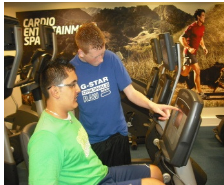
The gym at the Sovereign Centre