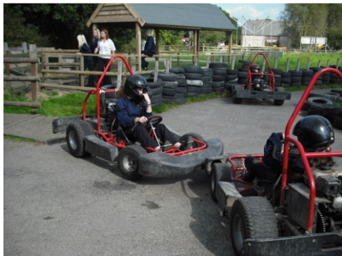
Go karting at Knockhatch